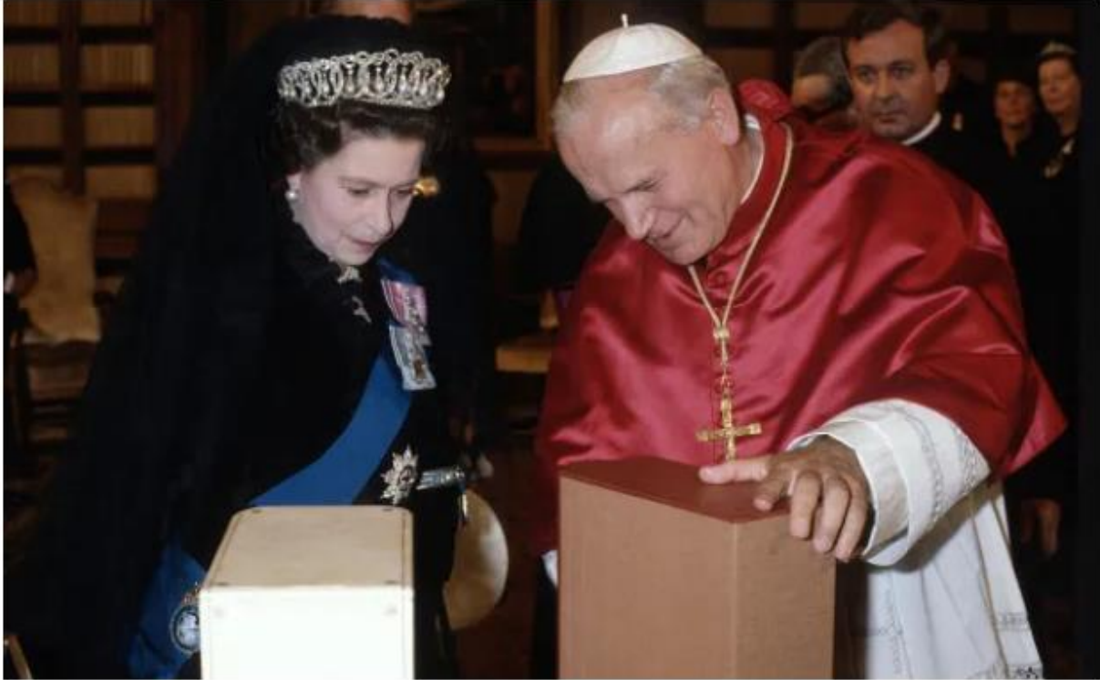
Queen Elizabeth II exchanges gifts with Pope John Paul II during her first visit to the Vatican on Oct. 17, 1980.

2000 October 17 ya shani, Queen Elizabeth II, Vatican kaw Wa Sarabyin hte bai sa hkrum ai.