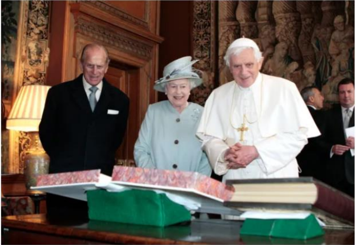
Prince Philip, Duke of Edinburgh (left) looks on as Queen Elizabeth II talks with Pope Benedict XVI and exchanges gifts during an audience in the Morning Drawing Room on day 1 of his four-day state visit to the United Kingdom at Holyrood House on Sept. 16, 2010 in Edinburgh, Scotland.

(Pope Benedict XVI's first meeting during his four-day visit to the United Kingdom in September 2010 was with Queen Elizabeth II in Edinburgh, Scotland. Benedict said it was a "very cordial meeting, characterized by the sharing of several profound concerns for the well-being of the world's peoples and for the role of the Christian values in society.")