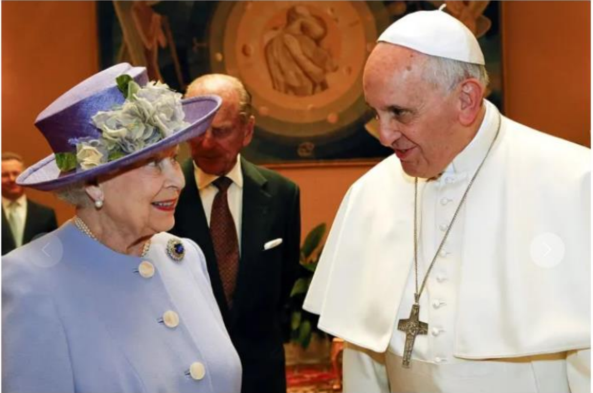
Britain's Queen Elizabeth II speaks with Pope Francis during their first meeting on April 3, 2014, at the Vatican.

(When Queen Elizabeth II met with Pope Francis at the Vatican in April 2014, she gave the pope a food hamper filled with local delicacies and a bottle of Balmoral whiskey. The meeting marked the 100th anniversary of the re-establishment of diplomatic relations between the United Kingdom and the Holy See.)